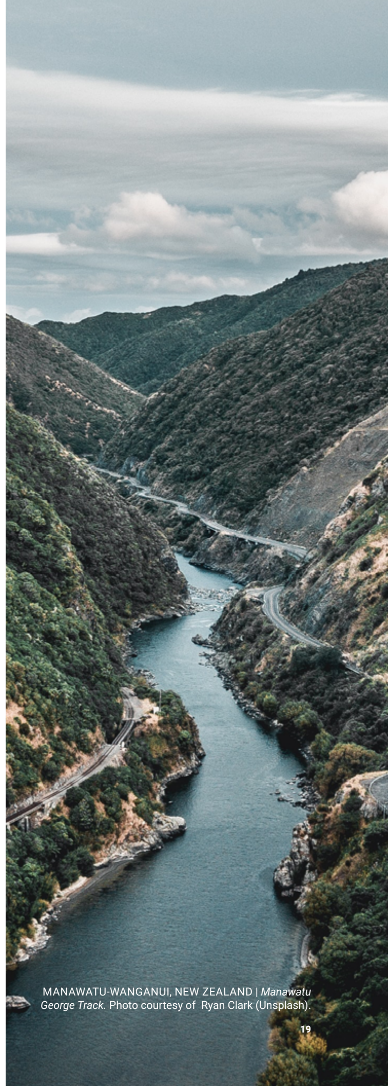
MANAWATU-WANGANUI, NEW ZEALAND | Manawatu George Track .

Melbourne Water is independent of the Birrarung Council. This independence allows the Birrarung Council to act as an unconstrained advocate for the river. In doing so, the Yarra River protection regime comes close to granting the river rights to independent representation and guardianship, similar to those adopted through explicit Rights of Nature measures (such as those in Aotearoa/New Zealand).