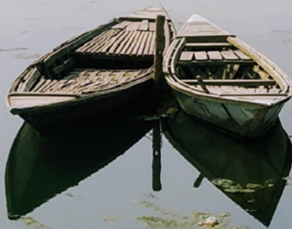
BANGLADESH | Two boats float on the Dharla River. Photo courtesy of Asif Rahman (Unsplash).

South Asia received significant attention from the Rights of Nature movement after two landmark decisions by the High Court of Uttarakhand in 2014. Both decisions, however, were later stayed by the Supreme Court of India. Attention has instead shifted to Bangladesh, where a 2019 ruling recognized the legal personhood of all rivers in that country. These substantive developments have been accompanied by procedural Rights of Nature developments in Bhutan and the Philippines.