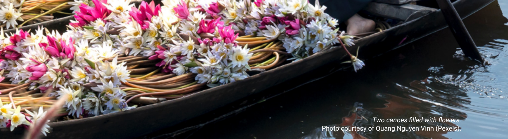
Two canoes filled with flowers.

PROCEDURAL RIGHTS: The entitlements that a person has to a certain process . A procedural right could include the right to a fair hearing in a court; access to information; or a right to participate in a decision-making process. Unlike substantive rights, procedural rights do not guarantee any outcomes . In the United States, procedural rights are sometimes referred to as “procedural due process.” See also: substantive rights; standing; personhood .