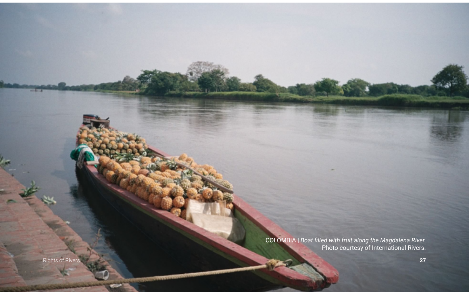
COLOMBIA | Boat filled with fruit along the Magdalena River.

Based on the previous judgments, the future generations will be recognized as the subjects of rights, and consequently will be granted the protection of fundamental rights to water, a dignified life and healthy environment; therefore, full