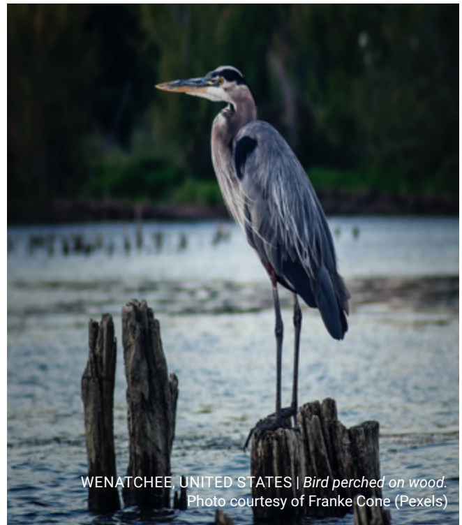
WENATCHEE, UNITED STATES | Bird perched on wood.

The Bolivian government appears unlikely to comply with the IRNT's decision. The Bolivian Minister of State, Dr. Carlos Romero Bonifaz, has rejected the authority of the IRNT, and instead has defended Bolivia's national efforts in recognizing the Rights of Nature and Indigenous peoples. 53