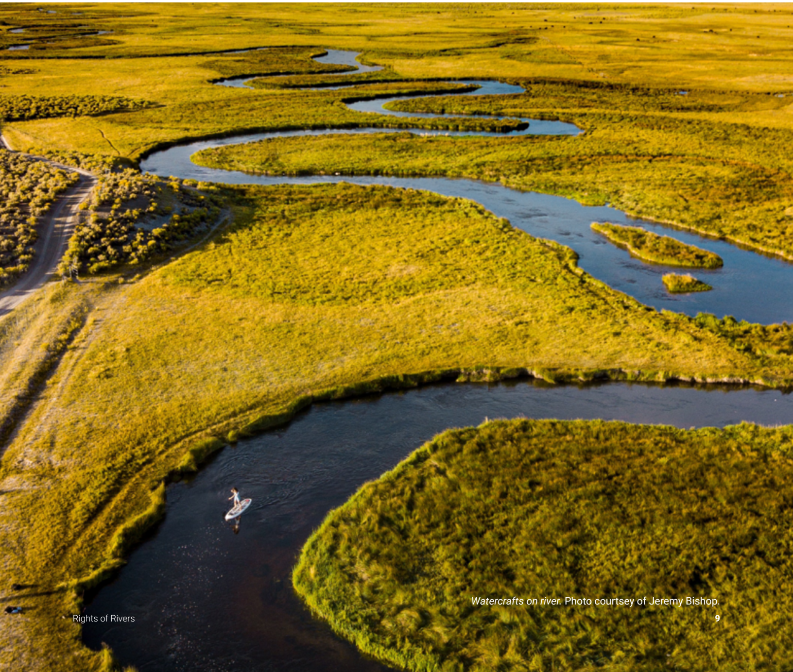
Watercrafts on river.

A grassroots and global movement: The cases demonstrate the importance of collective action and a strong and committed movement of local communities, environmental activists, lawyers, and others in efforts that may eventually culminate in court decisions and legislation. The work of campaigners, artists, educators, and others has an equally vital role within this movement. Rights of Nature is emerging within a new generation of ecocentric laws that provide the basis for a different kind of legal system. As decisions and laws continue to grow and expand, and as others join the movement, Rights of Nature offers a pathway towards new forms of governance and co-existence rooted in principles of respect for and harmony with nature.