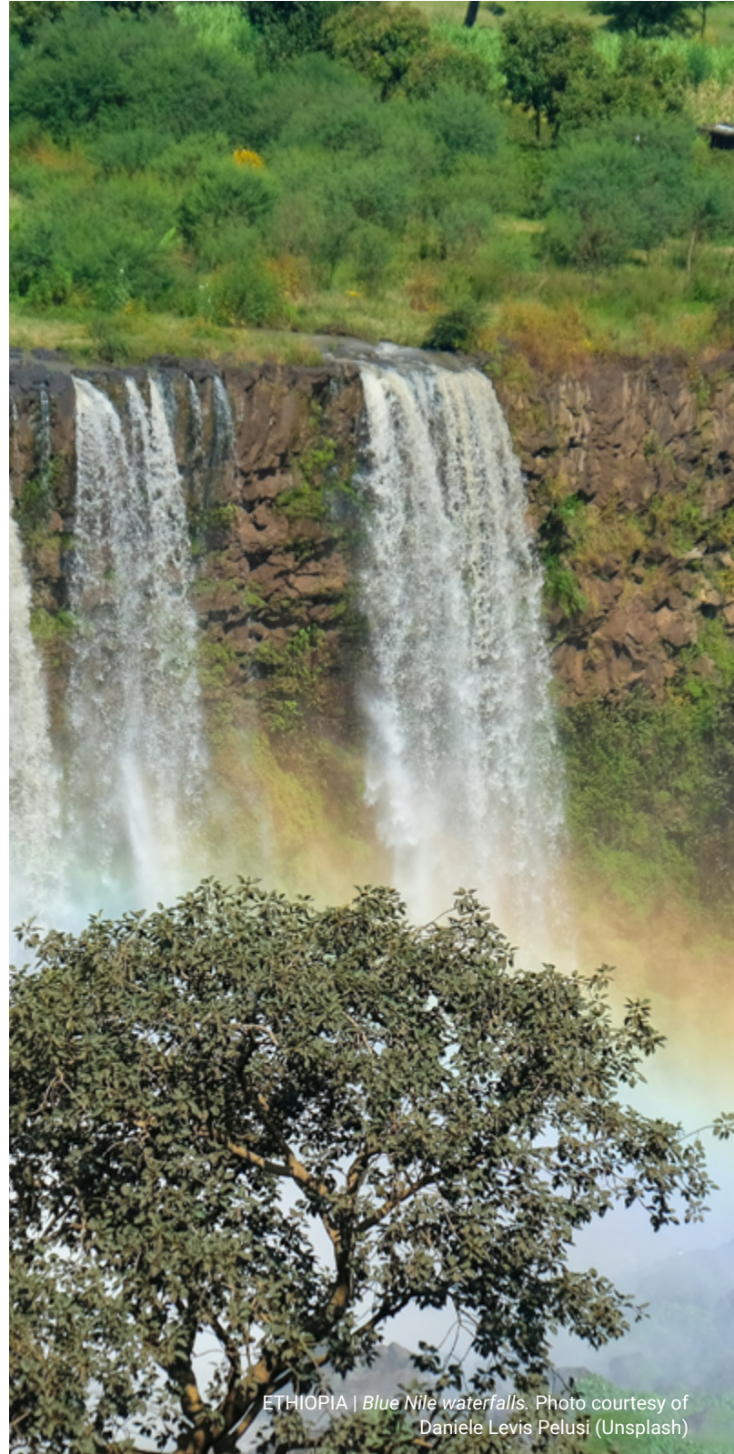
ETHIOPIA | Blue Nile waterfalls.

The Committee cited Rights of Nature developments in India and Aotearoa/New Zealand.