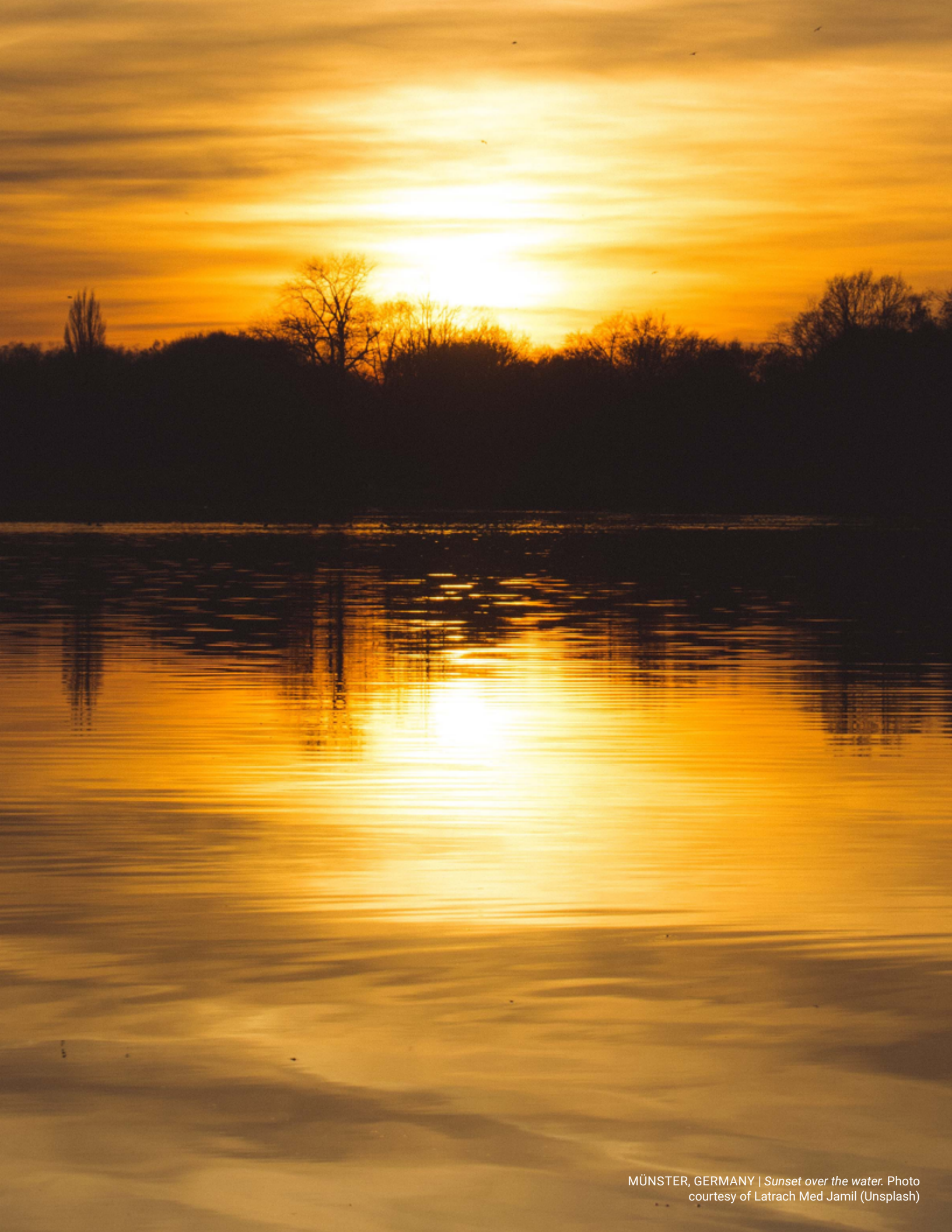
MÜNSTER, GERMANY | Sunset over the water.