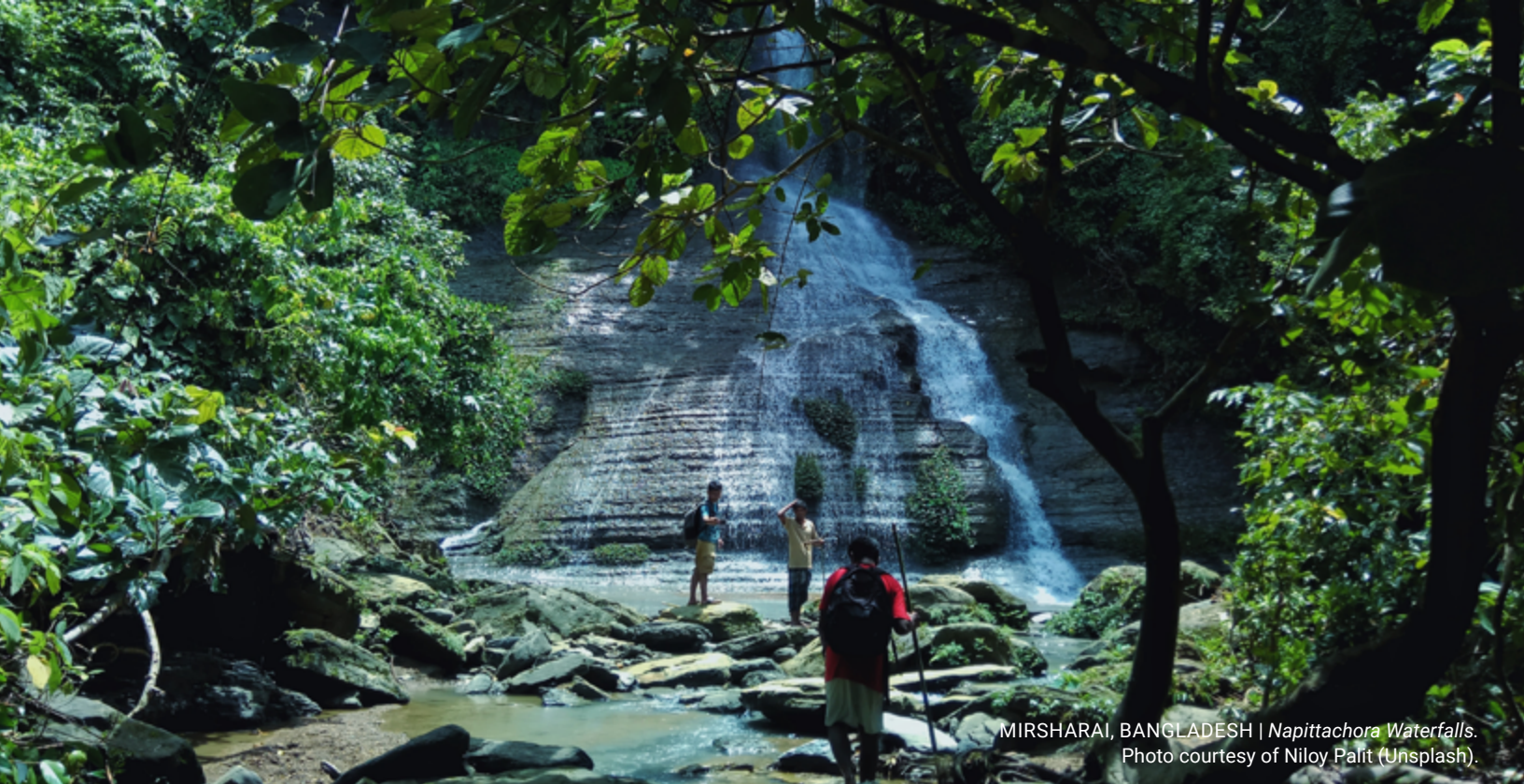
MIRSHARAI, BANGLADESH | Napittachora Waterfalls .