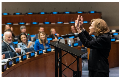
Sylvia Earle at the UN Ocean Race Summit, 2023