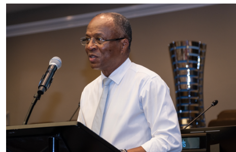
Prime Minister of Cabo Verde, Ulisses Correia e Silva, at the UN Ocean Race Summit, 2023